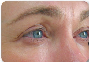
4 Months Post-Treatment