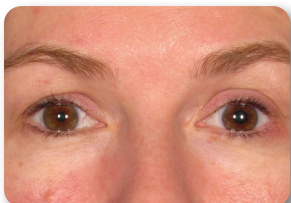
3 Months Post-Treatment