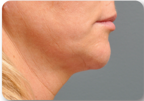
3 Months Post-Treatment