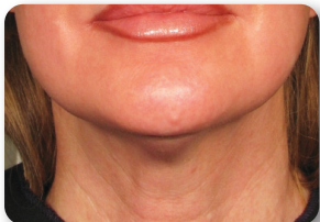
3 Months Post-Treatment