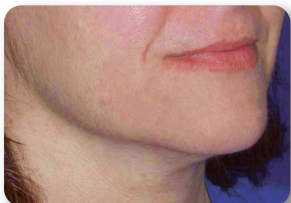
3 Months Post-Treatment

"Looking at my Before and After pictures, I was stunned – there was a major change!"